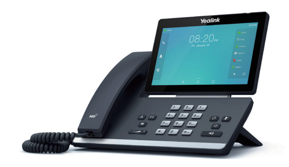
720P HD Video